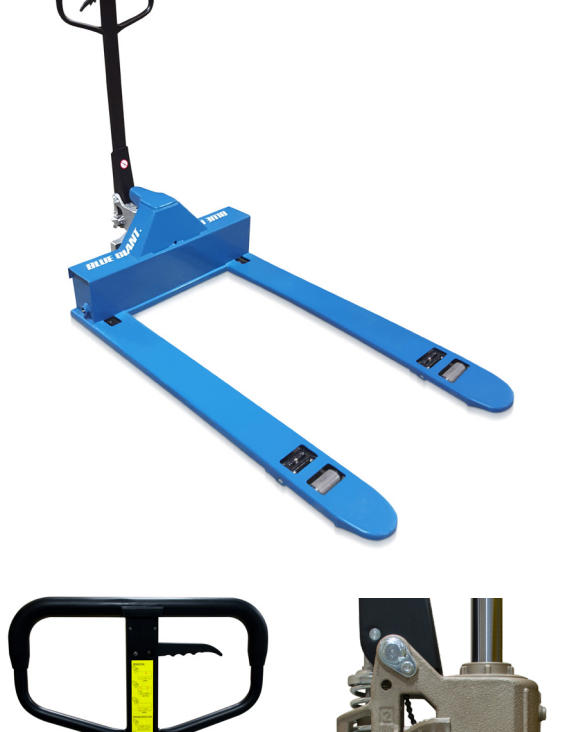
Comfort grip and easy access controls.

Corporate 85 Heart Lake Road South Brampton, ON, Canada L6W 3K2 t 905.457.3900 f 905.457.2313